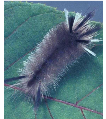
Moth (In the larva stage)